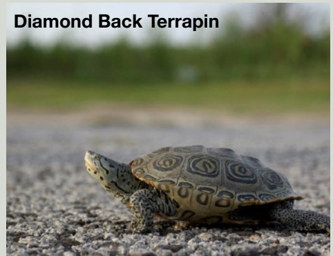
Diamond Back Terrapin

Field trips in April 2024 had these students involved with Diamondback Terrapin Conservation & Release on three occasions. During these trips which were held at Shell Thorofare, Jarvis Sound and adjacent waterways in Lower Township students released terrapins back into the salt marsh and inter-coastal waterway. Students also rescued and released terrapin hatchlings trapped in the local storm drain system that empty into our marine ecosystems. Students prepared for the Terrapin release by studying the boating and environmental threats as well as the life-cycle of the Diamondback Terrapin. Proper NJ regulations regarding terrapin excluder devices on recreational and commercial crab traps were also addressed.