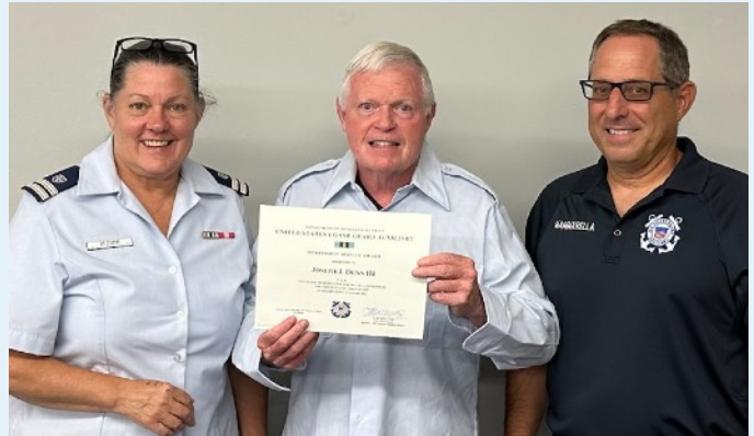
Joe Dunn Membership Service Award