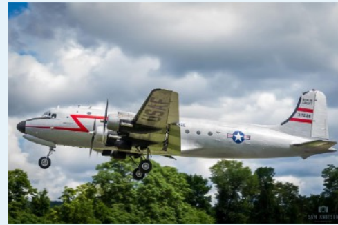
C-54 SPIRIT OF FREEDOM