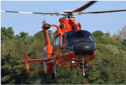
USCG MH-65 DOLPHIN

Every year we have the Airfest held at NASW in Lower Township and the USCG has a section of the hangar devoted to the CG. As Auxilliarists , we set up a table in front of the CG display and we have 1-2 members man that table throughout the weekend. We place literature about USCG, boater safety , etc on the table and interact with the public. It's a great way to teach the public about boater safety and spark some interest in joining the USCG. Once this table is set up, we leave it up for the whole weekend and the only thing we need at that point are members to man the tables.