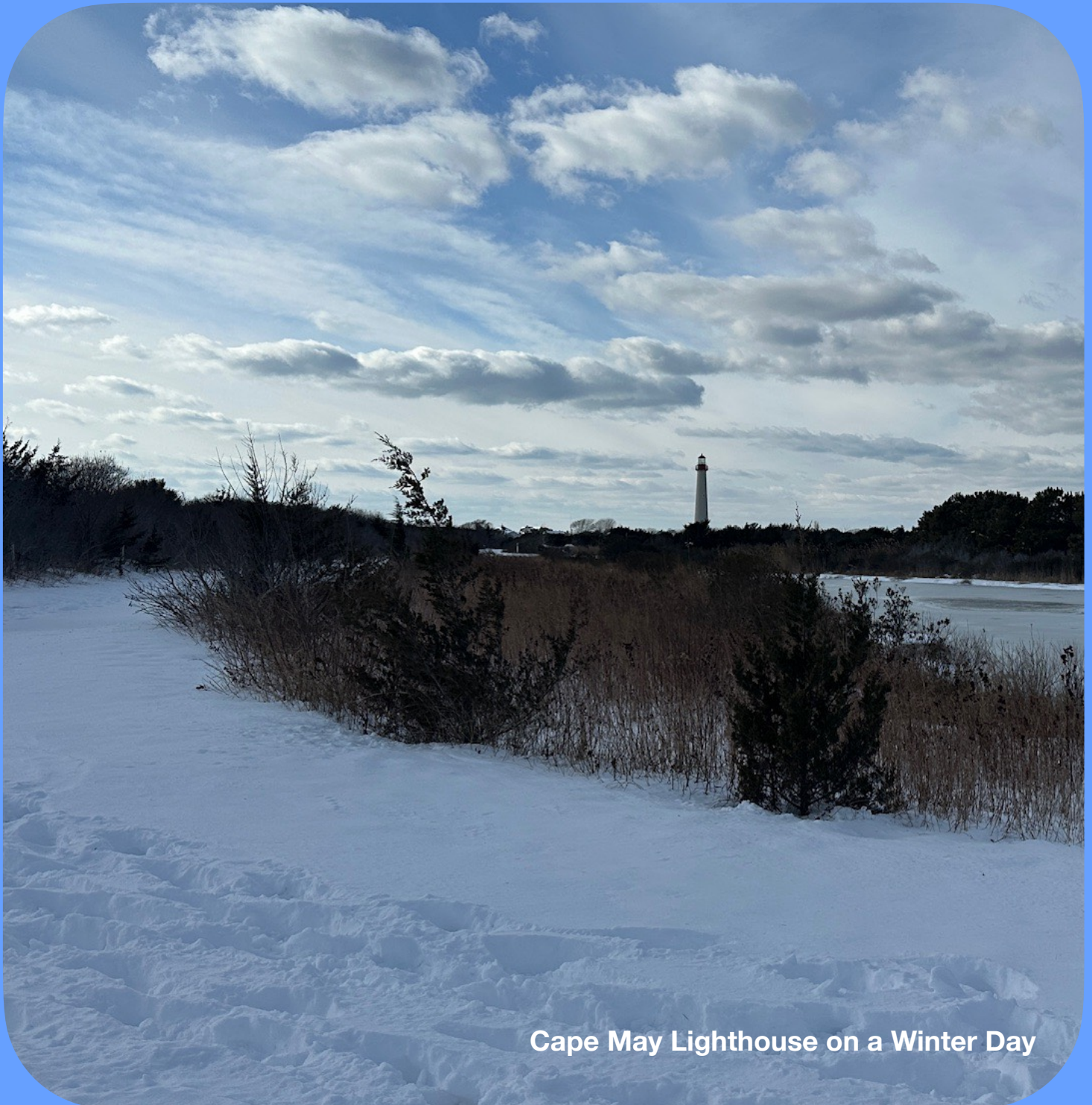
Cape May Lighthouse on a Winter Day